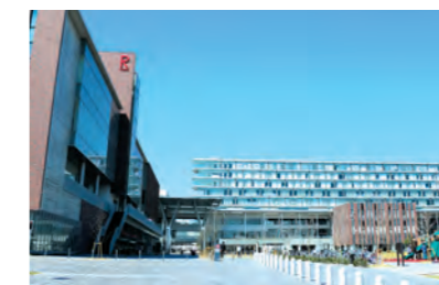
*Tracks Offered: RCJ, RCE

Located midway between Osaka City and Kyoto City, Osaka Ibaraki Campus (OIC) is RU's newest campus. The campus community works to facilitate collaboration with industry and government institutions and promote Ritsumeikan's activities on the frontline of social collaboration.