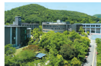
*Tracks Offered: IJL, RCJ, RCE

Kinugasa Campus (KIC) is the perfect example of Kyoto's harmonization between the traditional and the modern, and is a serene environment for education. Kinugasa is the university's center of liberal arts, social science and humanities studies.