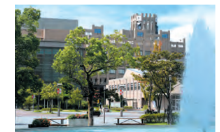
*Tracks Offered: RCJ, RCE

Biwako-Kusatsu Campus (BKC) serves as a center of education and research that integrates the sciences with the humanities. The campus is surrounded by natural beauty with mountains to the west and Lake Biwa, Japan's largest lake, to the east.